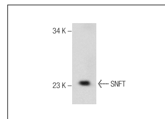
SNFT (M-13): sc-162246. Western blot analysis of SNFT expression in Jurkat whole cell lysate.