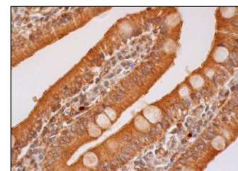
THP (D-20): sc-19552. Immunoperoxidase staining of formalin fixed, paraffin-embedded human duodenum tissue showing cytoplasmic staining of glandular cells.