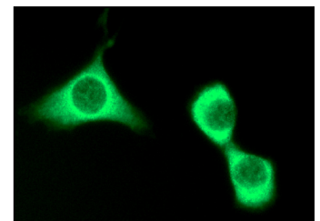
SerpinB6 (M-12): sc-21145. Immunofluorescence staining of methanol-fixed NIH/3T3 cells showing cytoplasmic localization.