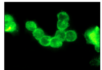
\beta B3-crystallin (V-20): sc-22412. Immunofluorescence staining of methanol-fixed Y79 cells showing cytoplasmic localization.