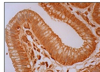
cyclin Y (S-19): sc-242539. Immunoperoxidase staining of formalin fixed, paraffin-embedded human gall bladder tissue showing cytoplasmic, membrane and nuclear staining of glandular cells.