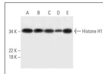
Histone H1 (H-2): sc-393358. Western blot analysis of Histone H1 expression in A-431 (A), LNCaP (B), HeLa (C) and HL-60 (D) whole cell lysates and Jurkat nuclear extract (E).